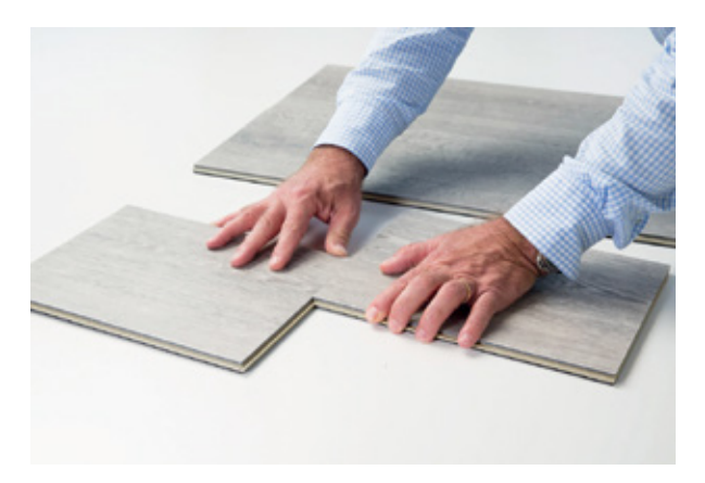
05: Press the planks gently while sliding