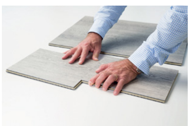
04: To disengage the short side, slide the planks in the opposite direction