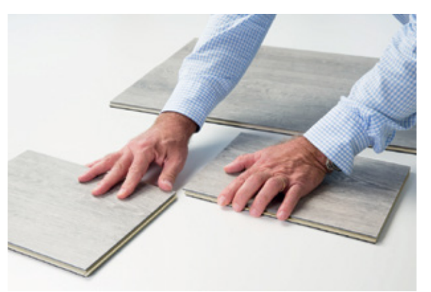
06: continue sliding untill the planks are fully separated