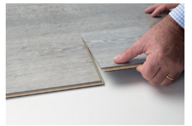
05: Continue pressing until you hear the "Click" sound of the drop-click lock system