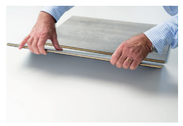
02: Grab the plank with both hands and gently lift until the plank disengages