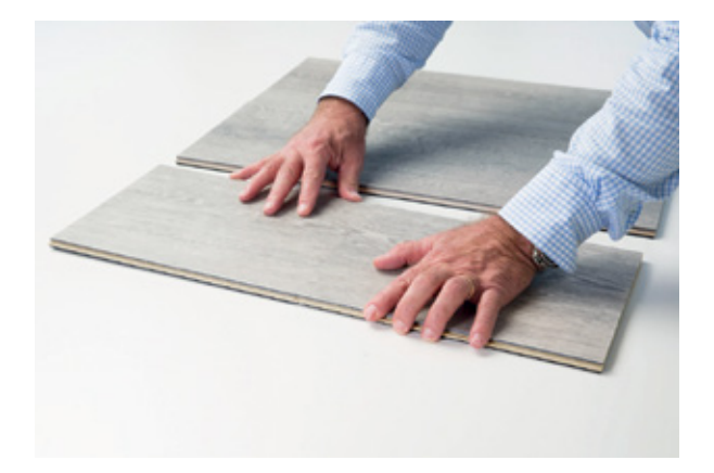
03: Place the planks gently on the floor