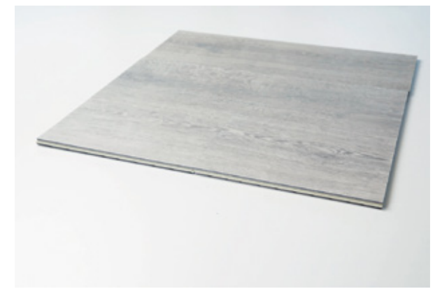
01: Always start by disengaging on the long side