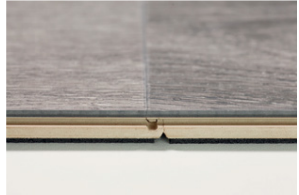
04: Press with your thumb on both ends of the short side